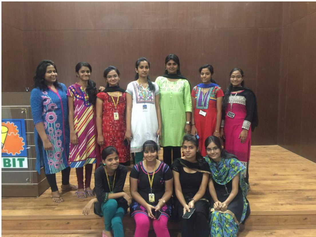
The team of WIE and Volunteers