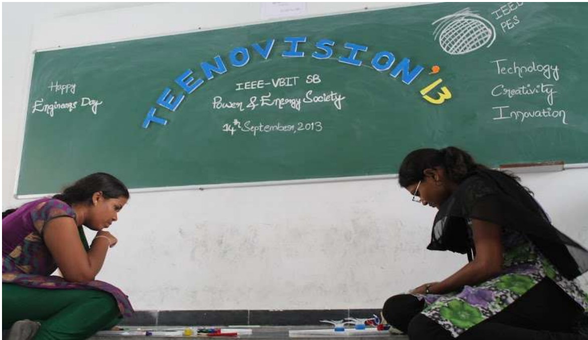
( Participants preparing their model)