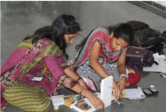
( Teams during the competition )