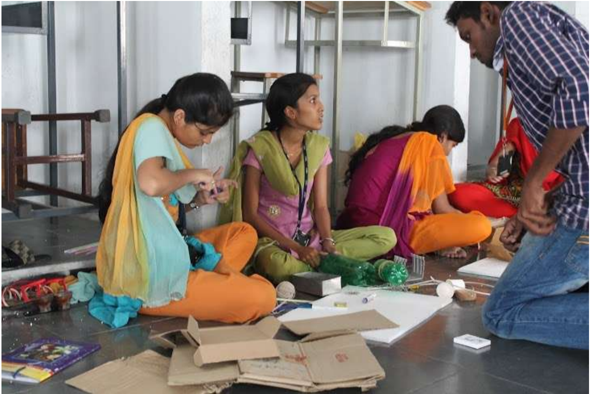
( organiser giving the guide lines )