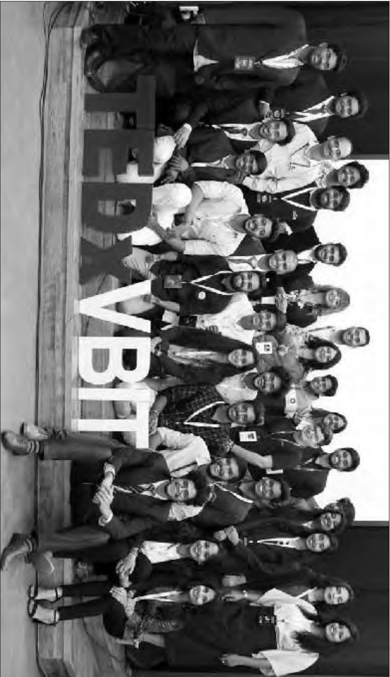
Team TEDx VBIT along with the distinguished speakers