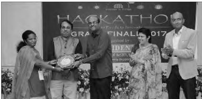
Institute was awarded as Highest Team Idea Submission in Cisco IoT Hackathon which took place in grand finale at Bhuvaneswar, Odisha state.