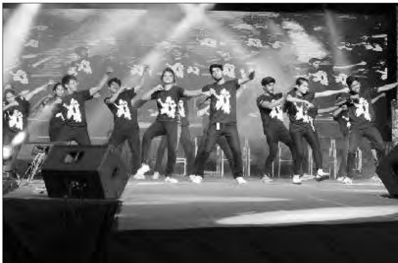
Cultural Programmes at VIBHA'18 - VBIT Traditional & Cultural Day