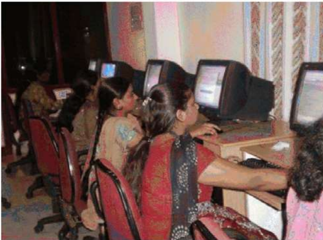
Above: Participants preparing their presentation.