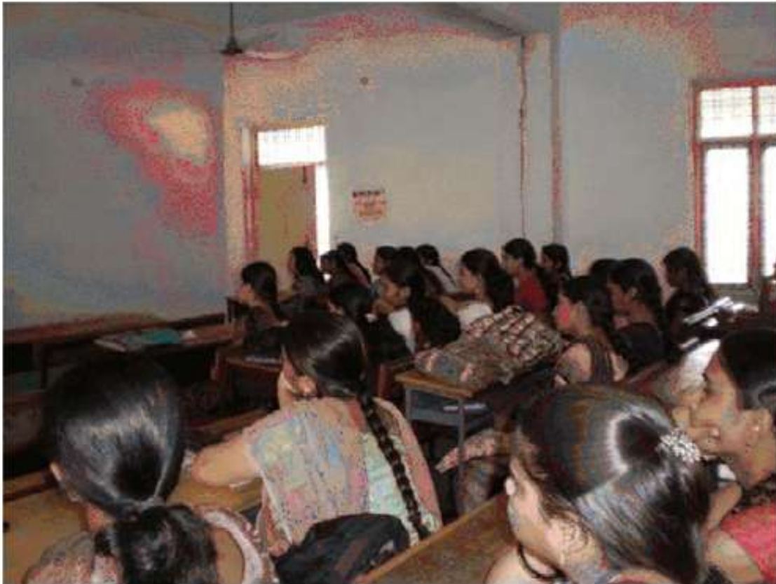
Above: participants listening to the lecture by the guests