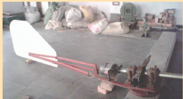
The coupling of main stator bars to the generator shaft and tail braces.