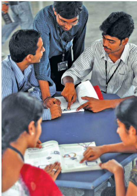
The branch places an emphasis on conducting activities that enhance the technical cognition of students while fostering essential leadership skills.

student members from other SBs but also technical experts and upper-level industry professionals who can be of great help to the student. Networking provides benefits that are specific to every student and, Vemula adds, the VBIT SB acknowledges it as an indispensable experience. As a result, all student members are given ample opportunity to build their network through eminent technical expertise and guidance on building soft skills.