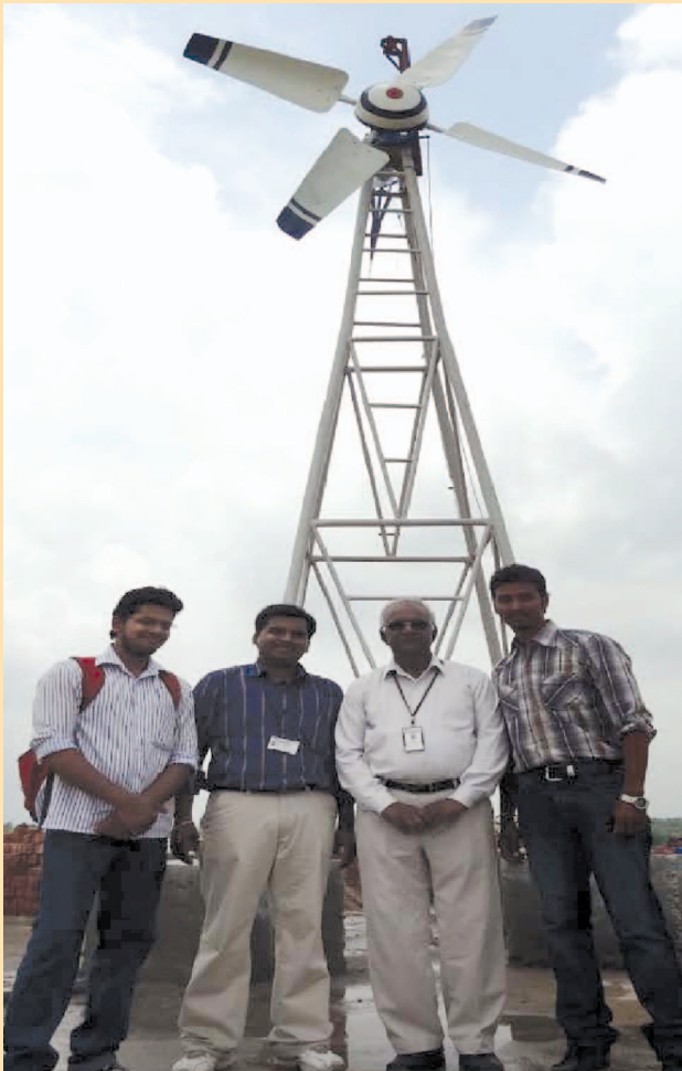
The team with inaugural dignitaries.