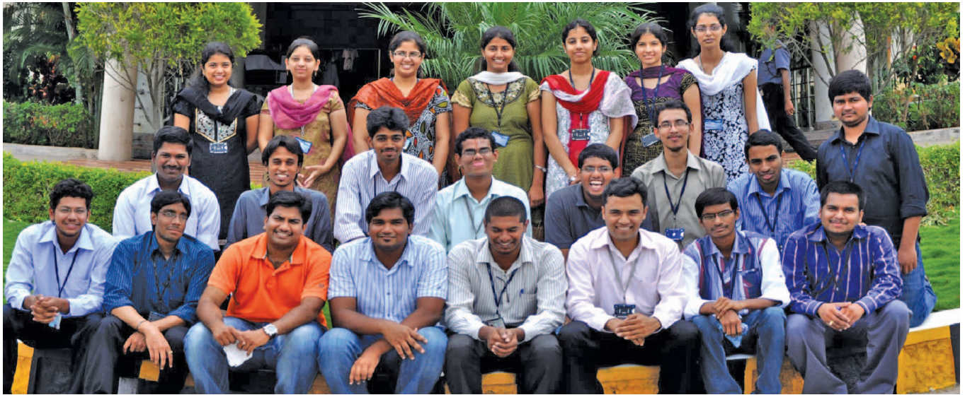
The IEEE VBIT SB is regarded as one of the most active branches in Region 10.