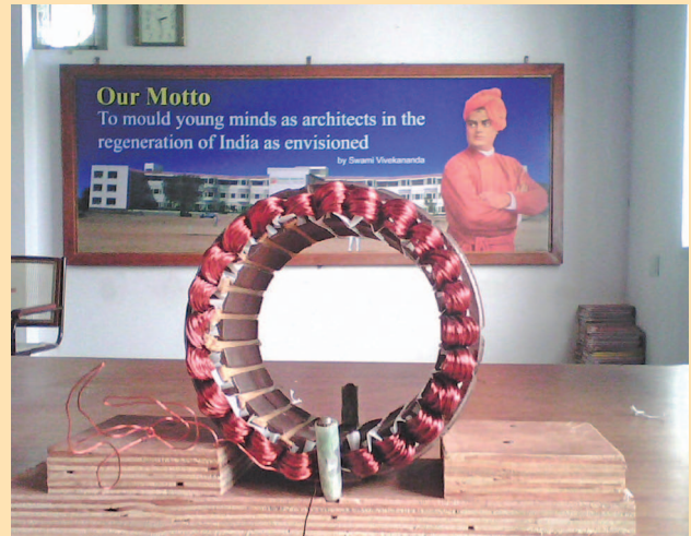
The stator being wound in a wave fashion with only one-phase winding.