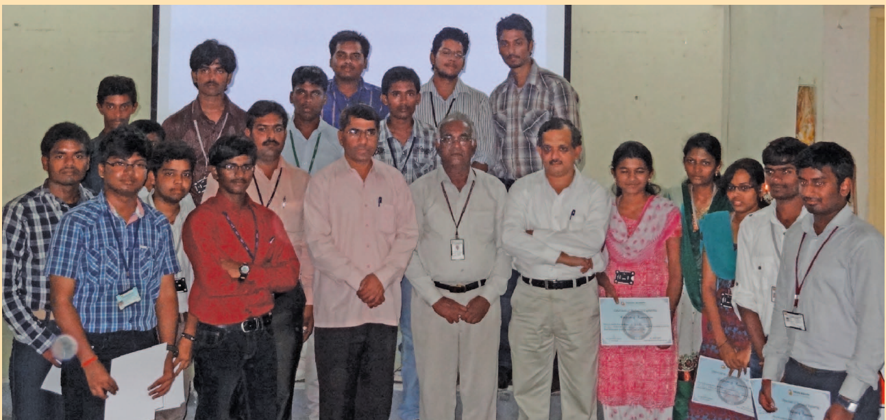
Members of the VBIT Windmill Project team.