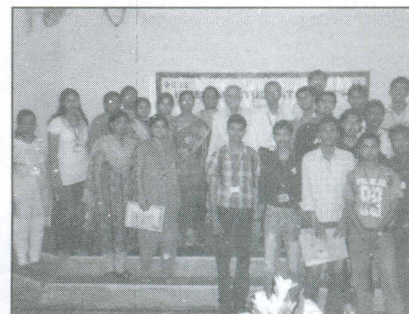
Picture of all the organizers shot after the event